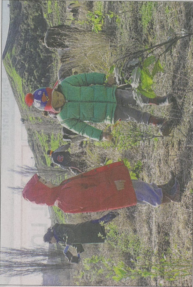
□ Gardeners of all ages took part in the community event where 5000 plants were established along the Whangawehi Stream.